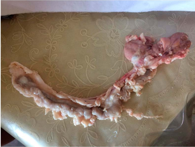
Illustration 3. View of part of the sheep with many tumors. Two women butchered the sheep in order to be eaten during the construction of a hogan, a traditional Diné house in Colorado, August 2017, Greasewood.

Both pictures depict tumors found in a sheep we had butchered a few hours before. According to the Diné environmentalists, this is more and more common. The animals drink water that is contaminated by uranium. Sheep are an essential part of the traditional Diné life. The Diné eat the meat and can sell the wool or use it to weave blankets. Butchering is also an occasion to gather- it has a social function. Sheep allow the Diné to participate in the global economy without leaving their land or engage in wage-based activities. Nowadays, sheep are eaten on special occasions and during ceremonies. They are highly respected and cherished. Sheep (“ dibé ” in Diné Bizaad) are like a member of the family. They are also a traditional food.