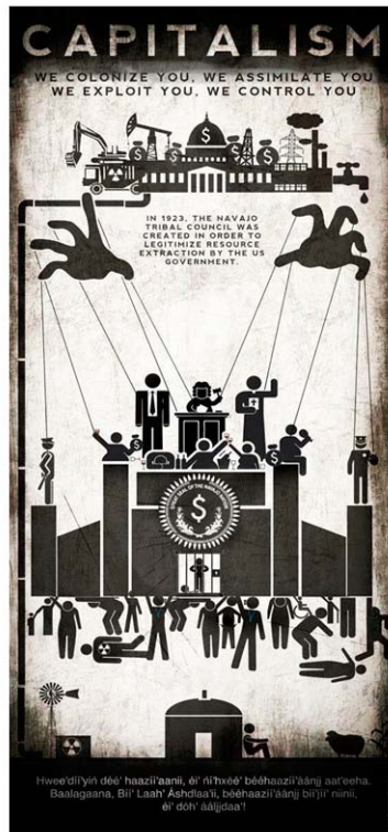
Illustration 2. This image appeared in social media and in the streets around the Navajo nation in response to the three-years lease extension the Navajo government gave to Peabody Company. July 2017.

These decisions have direct impacts on the daily life in the Navajo nation.