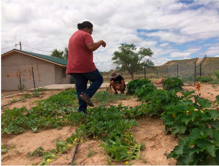
Illustration 4. two diné farmers in a community garden in Greasewood, Summer 2017: in the community garden of Greasewood where they planted vegetables and organized teachings. The community garden is just outside the chapter house. Everyone can go, water it and take vegetables. The farmers are not paid to provide these teachings, they believe that by showing the way and involving people, Diné people will go back to growing their food and restore their health.